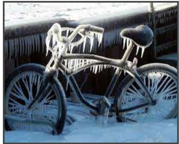
A sad sight.....

The TCBA Advocacy Committee ( http://advocacy.biketcba.org/ ) meets the second Wednesday of each month at The Avenue Café (2012 E. Michigan Ave., Lansing) from 6 to 7:30 p.m. Everyone is welcome to attend