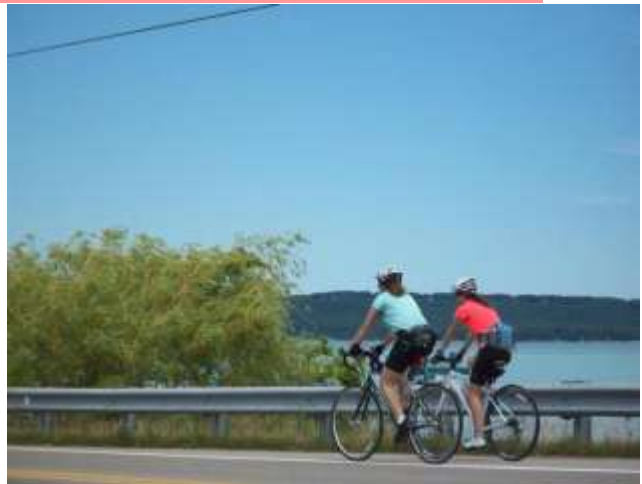
A few riders crossing Glen Lake on Northwest Tour.