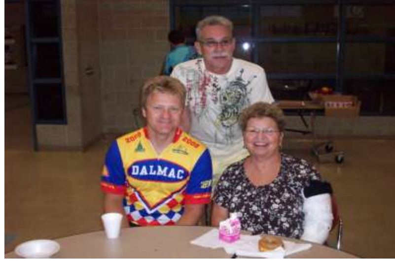
DALMAC photos from the Quint Century Route.