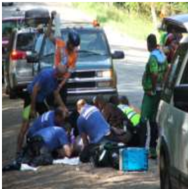
Crew of the EJEMS and DALMAC volunteers on scene providing assistance: Photo courtesy of Pat Harrington.

The volunteer East Jordan Emergency Medical Services (EJEMS) staff was quick to arrive – and worked on the downed rider for quite a while before transporting him to Northern Michigan Hospital in Petoskey. He was in bad shape, (later diagnosed with 3 arterial blockages and underwent a triple bypass operation). When we say “quick to arrive” we are not exaggerating –