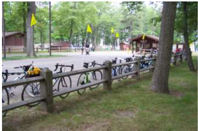
Bikes at Silver Lake