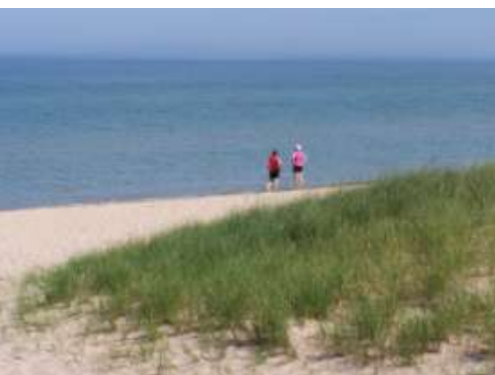
Riders relaxing and enjoying the view of the lake.

“On Thanksgiving Day, all over America, families sit down to dinner at the same moment – halftime. ”