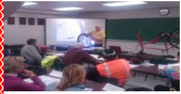
Photos of the Smart Cycling Class participants.

It is anticipated that another "Smart Cycling" class will be offered in the Spring or Summer of 2010. TCBA members will be given an opportunity to sign up for the class, before it is placed on the L.A.B. website. The preferred class size is 6 to 10 participants, and the cost will be approximately $30.