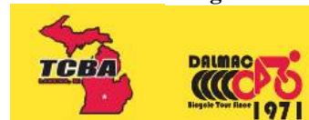
Left Sleeve Right Sleeve

In addition, we have a few of the old style "relaxed fit" size XL only, and some "pro fit" sizes XS, S and M are available for $45 each.